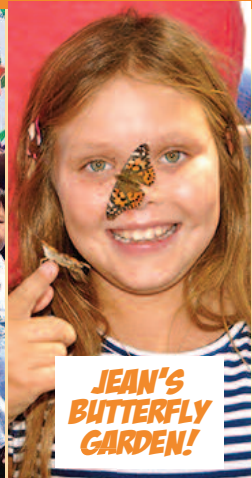
JEAN'S BUTTERFLY GARDEN!