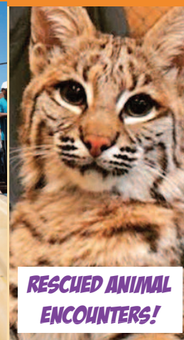
RESCUED ANIMAL ENCOUNTERS!