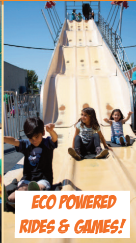
ECO POWERED RIDES & GAMES!